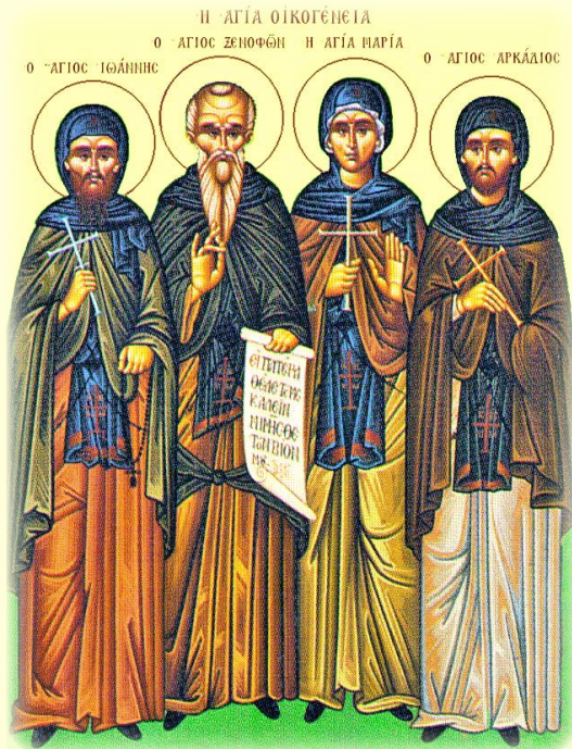
St. Xenophon, his wife Mary, and their sons Arcadius and John