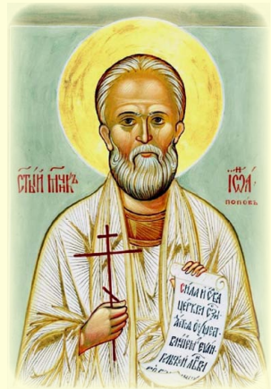
Holy New Martyr John Popov