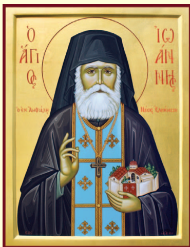
St. John the New Almsgiver, of Amphiale, Piræus ( read more here and here )