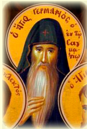
St. Germanos who struggled in asceticism on Mount Sagmatios