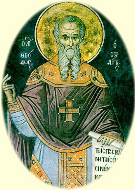
Translation of the Holy Relics of St. Theodore the Studite