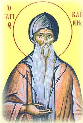
St. Clement, who struggled in asceticism on Mount Sagmatios