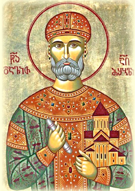
St. David the Restorer, King of Georgia ( Life )