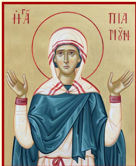
St. Piamun (Piama) the Virgin of Egypt