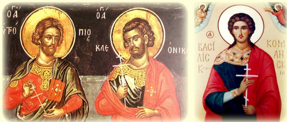
Holy Martyrs Evtropios, Kleonikos and Basiliscos of Amasea in Cappadocia