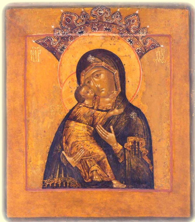
Synaxis of the Holy Icon of the Mother of God of Volokolamsk