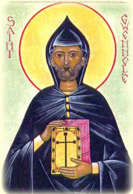
Saint Winwaloe (Breton: Gwenole ; French: Guérolé ) of Brittany