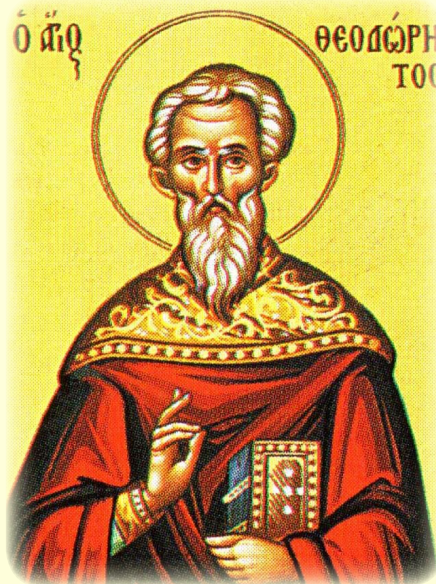
Holy Hieromartyr Theodoretos, Presbyter of Antioch