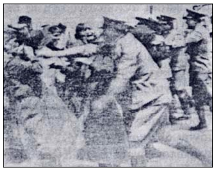
1/14 June 1935: Thousands of Old Calendarist Orthodox in front of the Metropolitan Cathedral of Athens, protesting the persecution of the three Confessor-Hierarchs (at left). Armed police attacking the "innocent and truly religious flock" of Christ (at right).

massive demonstration, which these truly pious Greek Faithful raised in a display of protest on the day of our trial by the Synodal Tribunal, if the police had not intervened, the people would have swept everything clean and restored the Orthodox Calendar to the Church through popular power, and in this way the ecclesiastical Schism would have been forestalled.<sup>19</sup>