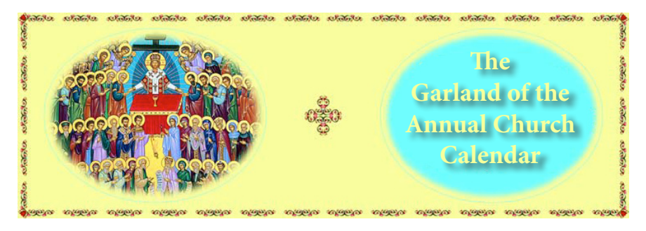
On the Occasion of the Bicentennial of His Blessed Repose