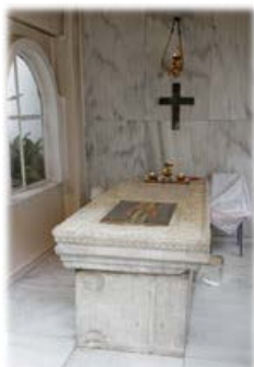
The Tomb of the Holy New Martyr Argyre, in Pikridion

Holy Relics of the Three Holy Hierarchs and of Sts. Solomone, Theophano, and Euphemia, and a part of the pillar against which our Lord was scourged), the Church (now a Mosque) of Sts. Sergios and Bacchos, the Hippodrome (with the three obelisks), and, finally, the glorious Church of Hagia Sophia!