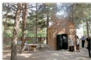
The Church of St. George, in a park in Gldani, Tbilisi.