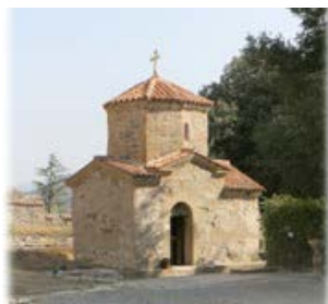
The Church of St. Nina in Mtskheta.