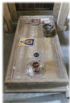
The tomb of St. Anthony the Stylite

Of greatest importance, however, was that chronic problems that have been plaguing the Diocese of Gldani, creating tensions and divisions among the clergy and laity, were addressed.