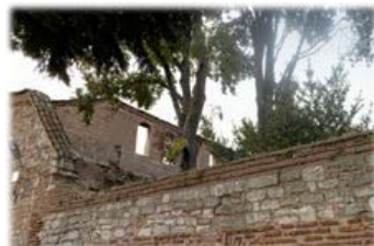
Monastery of St. Theodore the Studite

At 6:30 a.m. local time, we arrived in Constantinople, where we had the opportunity, until our afternoon flight to Athens, to visit a number of the places of Orthodox veneration, with a prevailing feeling of joyful sorrow: the Monastery of St. Theodore the Studite, the Church of Sts. Constantine and Helen, the Monastery of the Life-Giving Spring (Baloukle), the First Greek Cemetery, the Church of St. Paraskeve in Pikridion (with the tomb and Holy Relics of the Holy New Martyr Argyre), Blachernæ (with its Holy Water fount), the Phanar (with the closed Gate of St. Gregory V, the Church of St. George, the