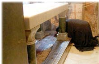
The Tomb of St. Nina, at the Convent dedicated to her in Bodbe.

†Metropolitan Cyprian of Oropos and Phyle