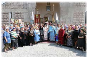
The Feast Day of the Church of the Panagia Portaitissa

Moreover, it came to our knowledge that there are certain other groups of anti-ecumenists in Georgia, which are not, however, in communion with our Holy Synod.