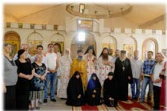
The Church of the Dormition of the Theotokos, in Gldani, Tbilisi.