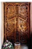
The Cross of St. Nina, Tbilisi.