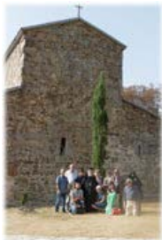
The Monastery of St. John of Zedazeni.