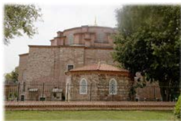
Left: the closed Gate of St. Gregory V at the Phanar; above: the Monastery of Sts. Sergios and Bacchos; right: Hagia Sophia