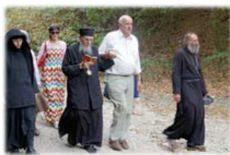
Heading towards the Spring of St. Nina in Bodbe.