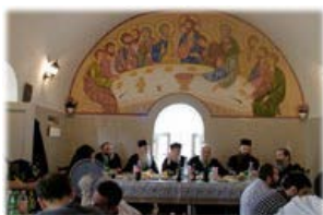
Agape meal at the Portaitissa parish.