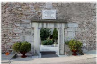
The Monastery of the Life-Giving Spring (Baloukle); Holy Water fount.