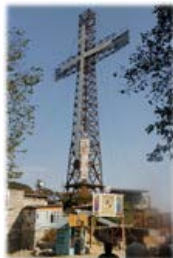
The Community of the Theotokos Portaitissa and the Venerable Cross, Zedazeni.