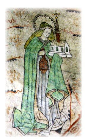
Medieval fresco of the Saint, Sweden

St. Gertrude ordered her monastics to fast and pray that God might reveal the location of St. Foillan's remains.