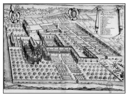
Monastery of Fosses

Sensing that her end was approaching, she gathered the Sisters, exhorted them to remain faithful to their monastic vows, and instructed them to bury her by covering her body with her hair shirt and her face with an old veil. This hair shirt and veil were later venerated by pilgrims along with her Relics.