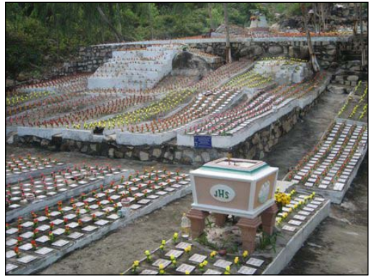
Left: Tong cries while looking at an unfortunate baby one last time before burying him. Right: Tong's cemetery: the resting place of more than 10,000 babies

plot of land to bury the babies in 2004. Since then, his cemetery for the unborn has received almost 10,000 aborted babies; and he has given each one a respectful burial, according to the report. Photos of the cemetery show rows upon rows of tiny graves, each marked with a plaque and a flower.