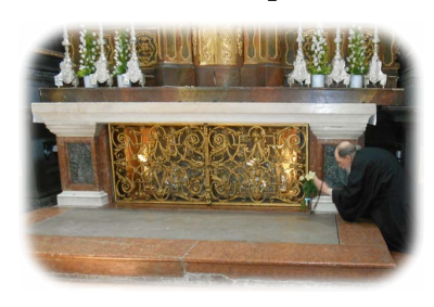
The Holy Reliquary of St. Emmeram

Following our arrival at the airport in Munich, we went with several of our faithful to the historic city of Regensburg, where the Relics of the Holy Enlightener and Hieromartyr Emmeram († September 22, 659) are preserved.