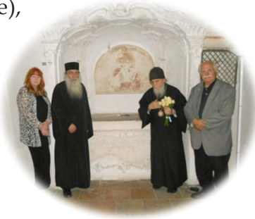
The place of the uncovering of the Relics of St. Emmeram

• On Sunday, July 16 (Old Style), commemoration of the Holy Fathers of the Seven Œcumenical Synods, we celebrated the Resurrectional Divine Liturgy, with our faithful from Munich, Nuremberg, and Salzburg, Austria in attendance.