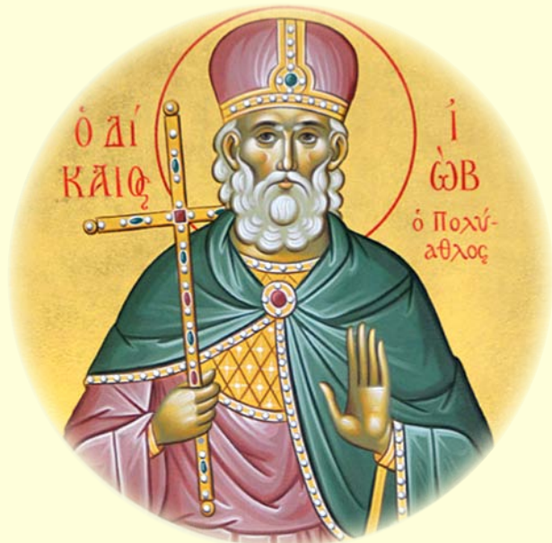
Holy and Righteous Job the Long-suffering