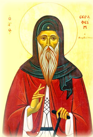
St. Seraphim, who struggled in asceticism on Mt. Daomvu in Levadia