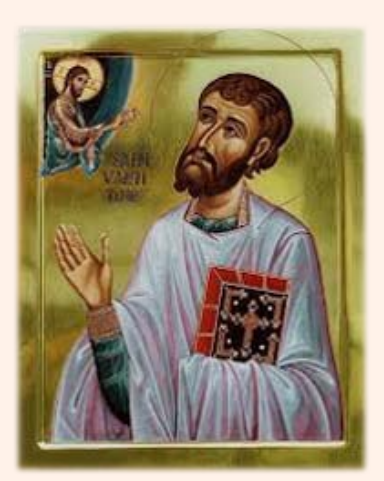
St. Valentine, Bishop of Interamna (modern day Terni, Italy)

An Orthodox Rejection of the Celebration of Valentine's Day